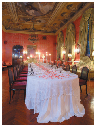
Verdi Gala Dinner